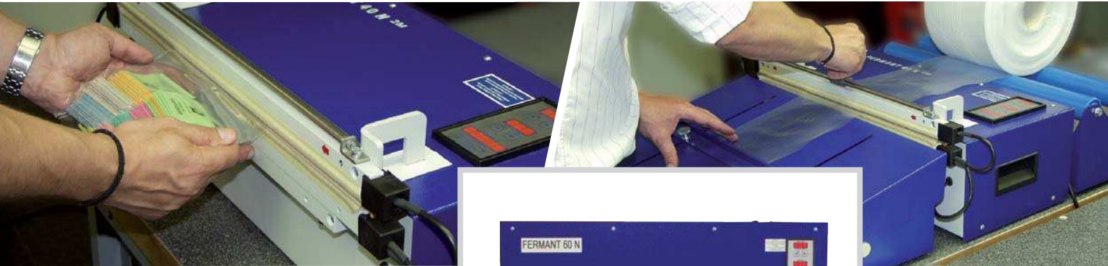
Table and floor stands for the FERMANT® N sealing devices