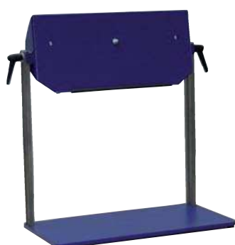
Table stand with clamping lever