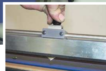
Manual cutting device