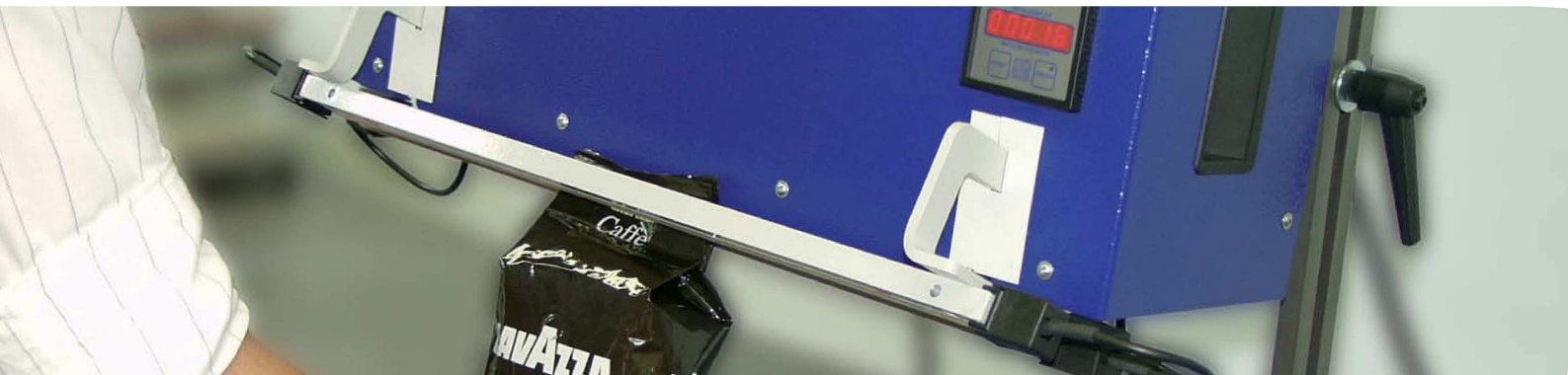
Sealing of food-packages