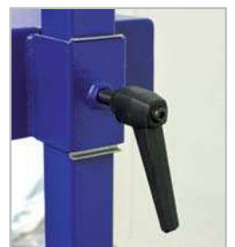
Floor stand LC with clamping lever