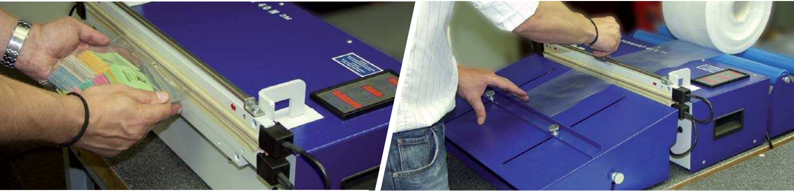
Packing of bulk materials etc.