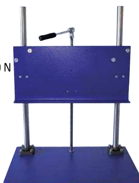
Table stand with ratchet